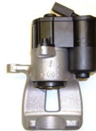
Caliper with electric parking brake