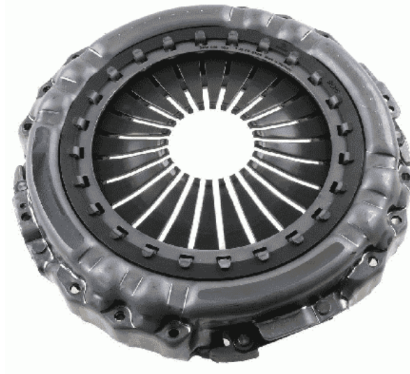
Clutch pressure plate