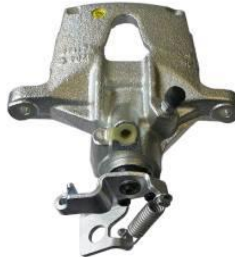
Caliper with parking brake