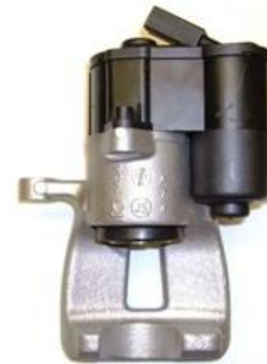
Caliper with electric parking brake